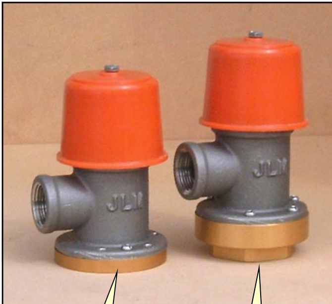
ORA-1000 Surface Flange Mount