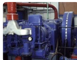
Diesel & Natural Gas Engines