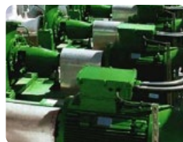
Larger API Pumps